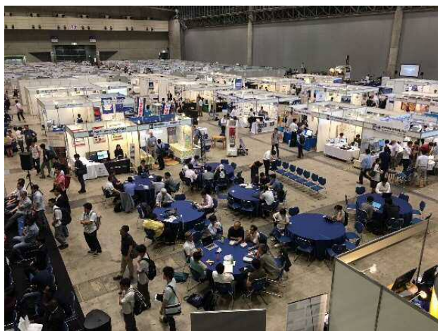
Photo: View of exhibition of JpGU

JpGU 2020 is planned as the second joint event with the American Geophysical Union (AGU) from 24 th May to 28 th May 2020 at Makuhari Messe in Chiba. Joining more than 1,000 researchers from overseas are expected, and attractive activities are planned.